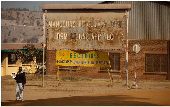
State-owned mining company Gécamines, known as the DRC's 'black box' for its disappearing revenues.

nowhere, Evelyne became the preferred buyer of a valuable DRC state mining asset.