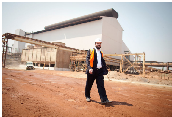
Dan Gertler was sanctioned by the US for “corrupt mining and oil deals” in DRC.

In June 2018, the US added another 14 entities affiliated with Gertler to its sanctions list. The Treasury Department said that these companies have “enabled Dan Gertler to access the international financial system and profit from corruption and misconduct”. 26 Following this second round of designations, a total of 34 individuals and entities connected to Gertler, including Gertler himself, had been sanctioned under the Global Magnitsky Act. 27 Following a March 2020 OFAC revision, one of these companies was removed from the sanctions list. 28