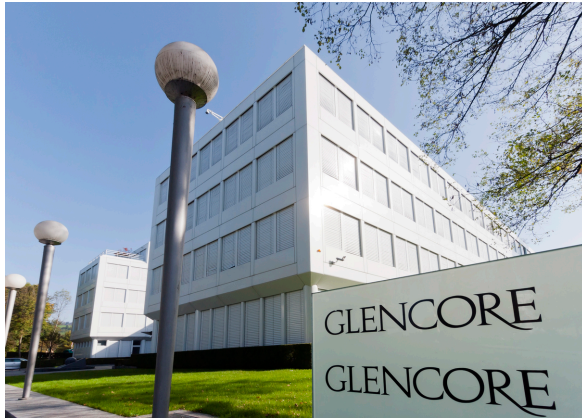
Commodity giant Glencore continues to line the pockets of Gertler.

risk losing its hugely valuable copper and cobalt assets in DRC.