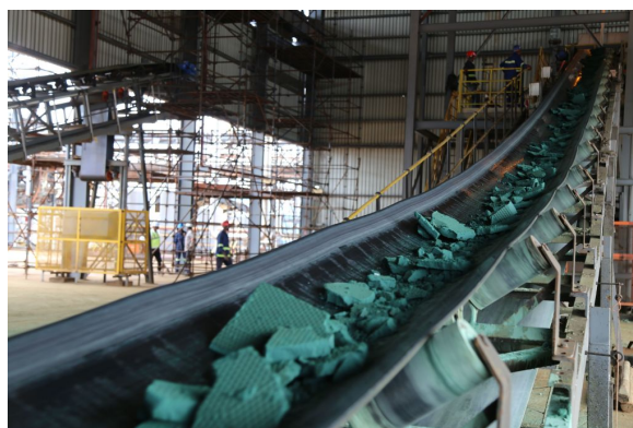
A conveyor belt carries chunks of cobalt at a plant in Lubumbashi. DRC is home to nearly 50% of the world's cobalt.

When the US Treasury imposed sanctions on Gertler it sent shockwaves through DRC's mining sector, as one of its most prominent figures had been cut out of the international financial system, making business with him much more extremely difficult. However, evidence suggests Gertler and his associates used Afriland Bank, a DRC commercial bank offering transactions in both U.S. Dollars and E.U. Euros, to try and obscure potentially sanctioned activities. Evidence