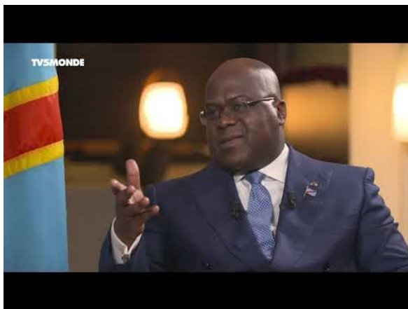
President Felix Tshisekedi mentions Afriland First Bank in a TV interview in September 2019.